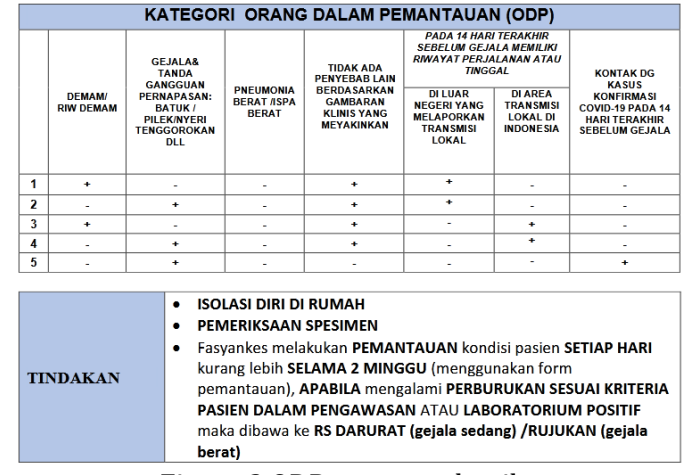
Figure 2 ODP category details