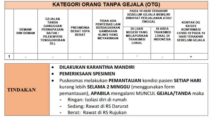
Figure 3 OTG category details

2) Orang Tanpa Gejala (OTG)/ People In Monitoring